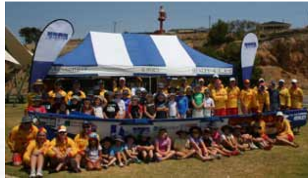
Members of Henley SLSC with Stansbury Primary School students

This event is also used to promote the message of "swimming between the flags" and to heighten awareness of beach safety issues. As part of the National Surf Life Saving Program to educate school children living in regional areas, each year Henley SLSC conducts a Beach Safety session for the Stansbury Primary School which has received fantastic support from the local community.