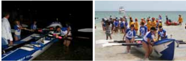
5am - The start of the Big Row 2008 at Stansbury

This event is Henley Surf Life Saving Club's major annual fund raiser and involves a collaborative effort from our female, junior and male members rowing a surf boat 68kms across the Gulf St. Vincent from Stansbury on the Yorke Peninsula to Henley Beach. Now in it's fifth year, the 2011 Big Row will take place on Saturday 12th February.