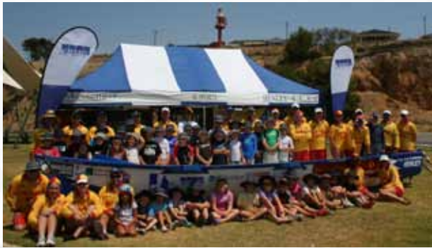
Members of Henley SLSC with Stansbury Primary School students

This event is also used to promote the message of "swimming between the flags" and to heighten awareness of beach safety issues. As part of the National Surf Life Saving Program to educate school children living in regional areas, each year Henley SLSC conducts a Beach Safety session for the Stansbury Primary School which has received fantastic support from the local community.