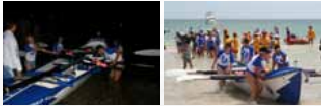
5am - The start of the Big Row 2008 at Stansbury 2pm - The finish at Henley Beach 68kms later!

This event is Henley Surf Life Saving Club's major annual fund raiser and involves a collaborative effort from our female, junior and male members rowing a surf boat 68kms across the Gulf St. Vincent from Stansbury on the Yorke Peninsula to Henley Beach. Now in its fourth year, the 2010 Big Row will take place on Saturday 30 January.