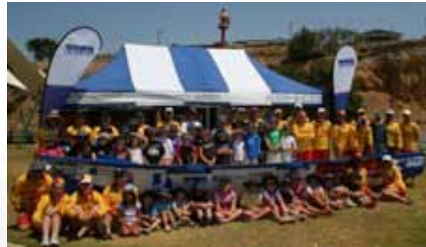
Members of Henley SLSC with Stansbury Primary School students

This event is also used to promote the message of "swimming between the flags" and to heighten awareness of beach safety issues. As part of the National Surf Life Saving Program to educate school children living in regional areas, each year Henley SLSC conducts a Beach Safety session for the Stansbury Primary School which has received fantastic support from the local community.